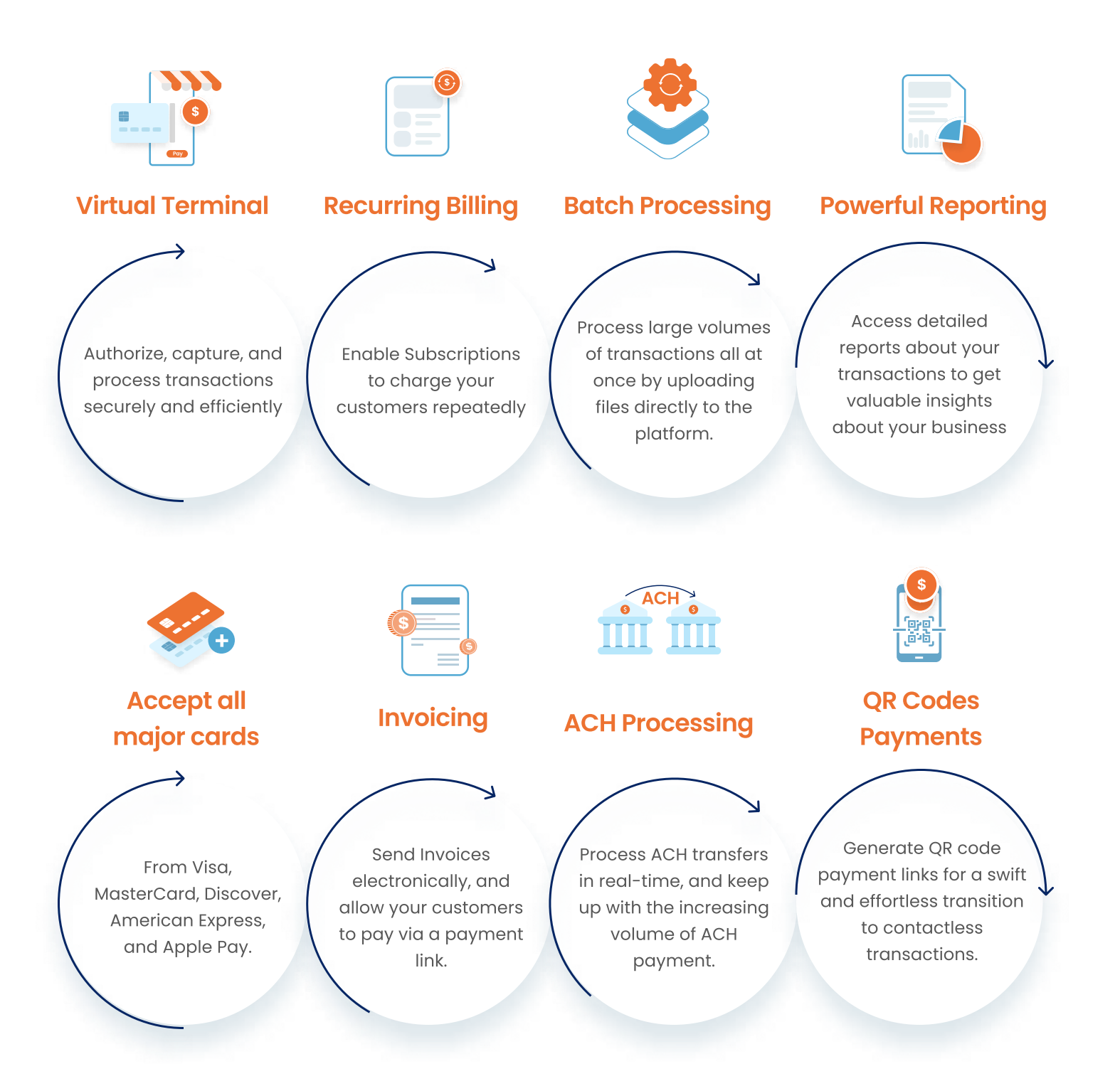
Total Acceptance Gateway